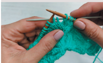
2. Hold at the back