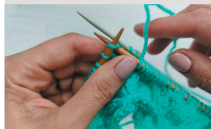
3. Knit next 2 sts