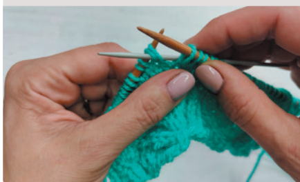
1. Slip 2 sts to cable needle