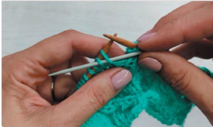
1. Slip 2 sts to cable needle