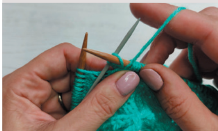
4. Knit 2 sts from cable needle