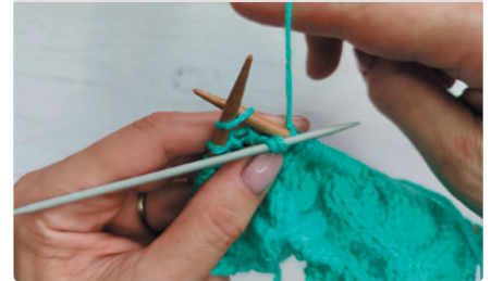
3. Knit next 2 sts