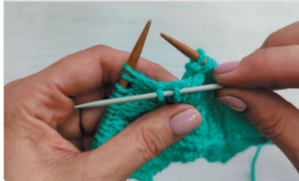
2. Hold at front