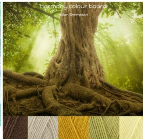
Stylecraft Special Dk-4mm-G hook Walnut, Parchment, Mustard, Lemon, Pistachio