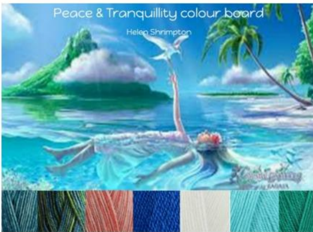
Stylecraft Batik Teal, Krypton , Coral Stylecraft Life Dk French Blue, White, Aqua, Ivy 20% wool - 80% Acrylic 4mm G hook