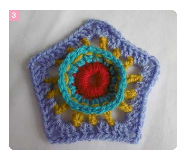
Round 5: Join color5 in any ch-3 corner sp by ch2 (counts as 1dc), (1dc, ch3, 2dc) in same sp (forms a corner), 1dc in each of next 10 sts, *(2dc, ch3, 2dc) in next ch-3 corner sp (forms a corner), 1dc in each of next 10 sts, rep from * 3 times more, sl st in 2nd of ch-2 to complete. [14dc on each side]