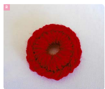
Round 2: Join color2 in any st by ch2 (counts as 1dc), 1dc in same st, 2dc in each st to end, sl st in 2nd of ch-2 to complete. [30dc]